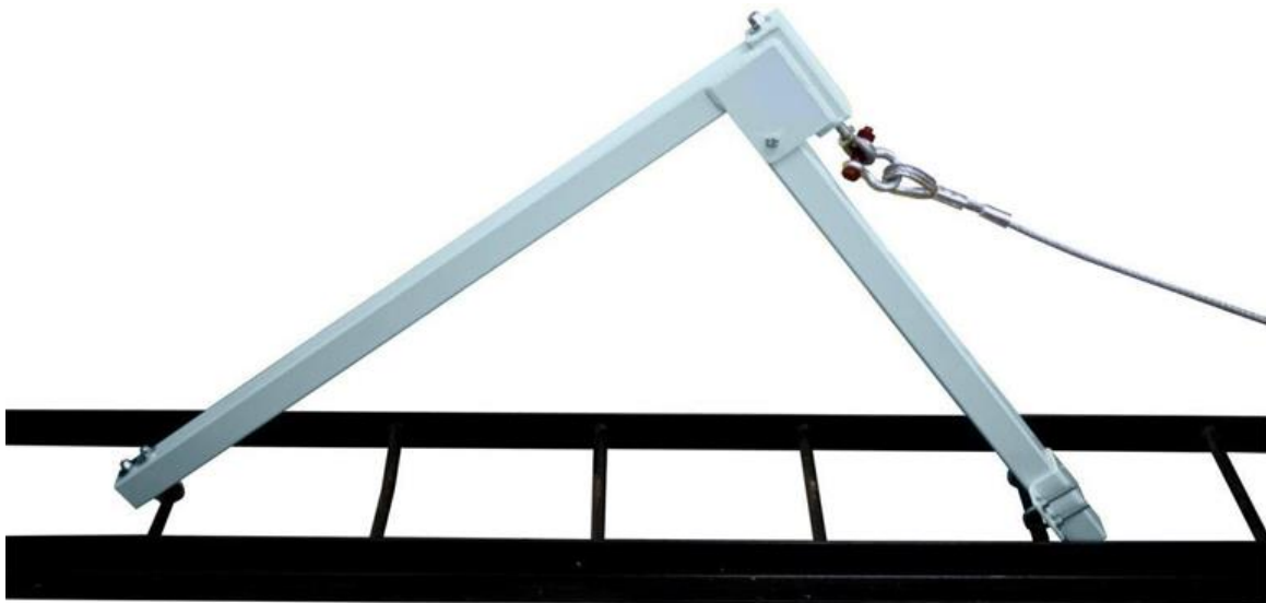
Curved Ladder Top Bracket Figure 3

The top bracket (Figure 3) should be positioned on the rungs to allow the user to safely connect and disconnect to the cable between uses. The bracket can be installed up to 12" (30.5 cm) off- center of the ladder if required. Place the U-bolt bracket near the base of the pivoting leg. Using U- bolts, fasten each leg (one on the stationary leg and two on the pivoting leg) onto the corresponding rung of the ladder and tighten the six nuts, ensuring that the legs are held securely in place.